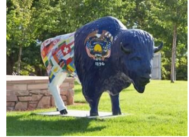
Salt Lake City's buffalo: